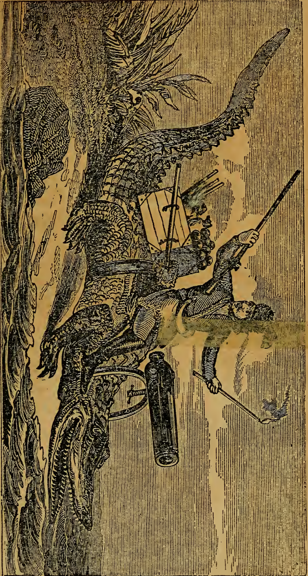
CROCKETT DEFENDING THE MOUTH OF THE MISSISSIPPI.